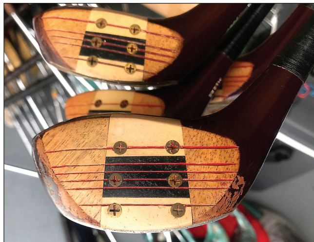
6-SCREW M-85W EYE-O-MATIC. Wonderful example of these clubs, all original and very valuable to this day.