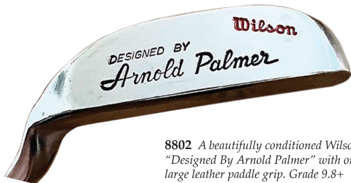
8802 A beautifully conditioned Wilson 1962-63 "Designed By Arnold Palmer" with original large leather paddle grip. Grade 9.8+