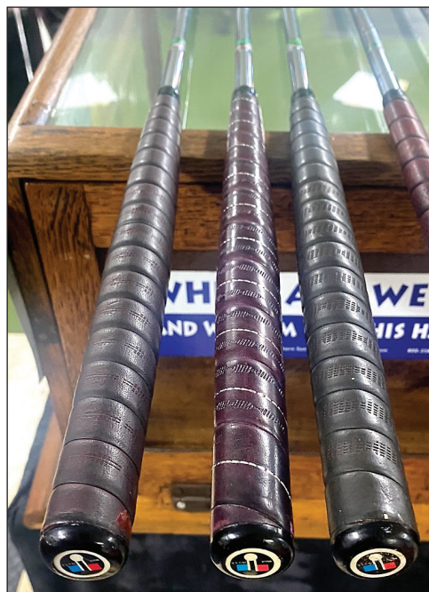
FAT LEATHER PADDLE GRIPS. Some beautiful examples of the original grips that come on the Wilson Palmers. Solid burgundy, burgundy w/ silver lining, solid brown. (Not shown is the most common black w/silver lining).