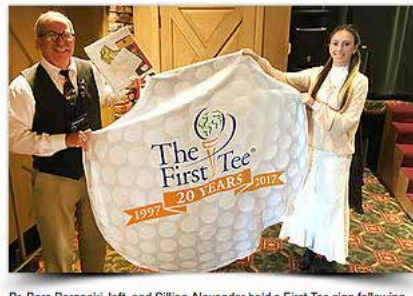
their presentation to the membership on youth activities for golf collecting