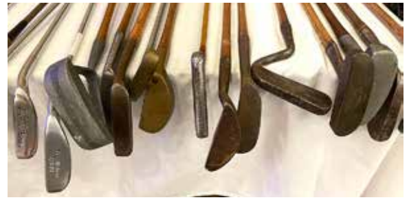
Examples of putter innovations.