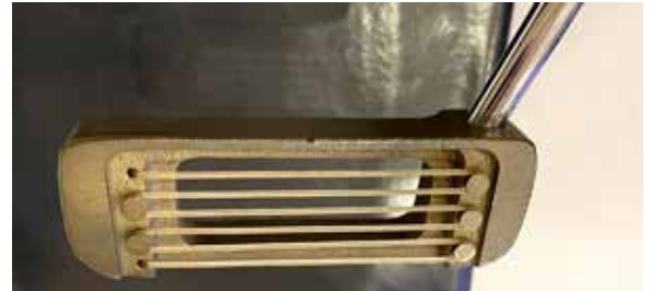
One of the more unusual creative attempts.