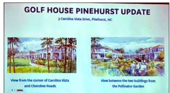
A slide from the USGA presentation shows an artist’s rendering of the proposed Golf House in Pinehurst.