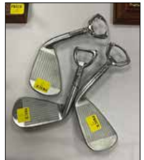
Bruce Strom of Columbus, Ohio, had a variety of handmade collectibles at the show, including clubheads made into bottle openers.