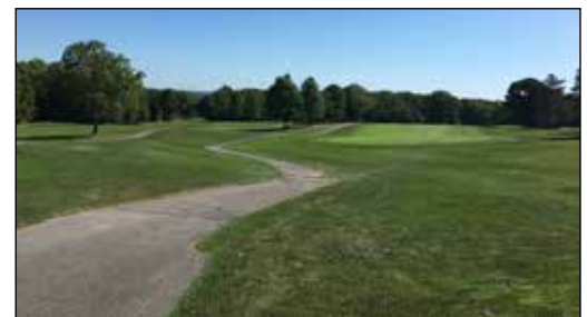
Sleepy Hollow GC.

What can we say? It is golf and played with hickory shafts or otherwise, it is always a delight to share the game