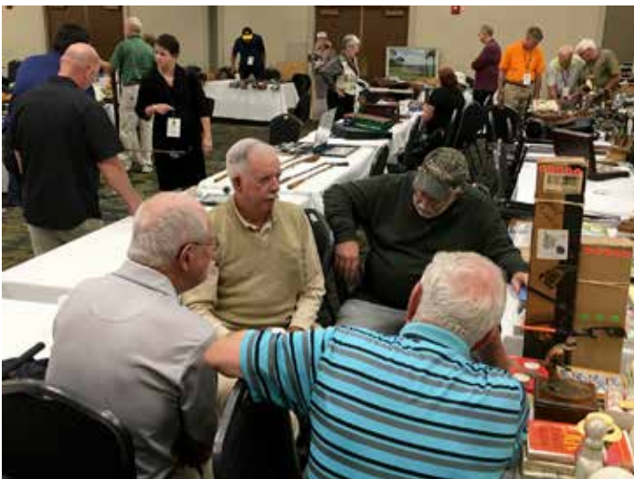
Important discussions on matters of golf and golf collecting.